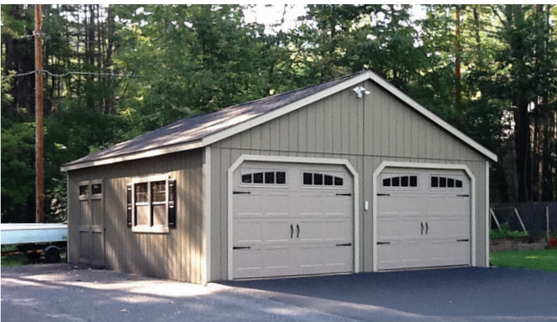
2-Car New England Garage 24'x26' - Clay w/almond trim. 5/12 Roof Pitch. Options Shown: Upgraded overhead doors, shutters, double doors, Transom windows.