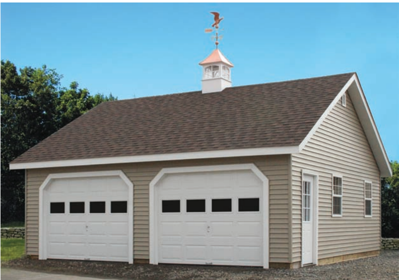
7/12 Pitch Vinyl 2-Car Garage 24'x24' - Clay with White trim; Options Shown: upsized windows, upgraded single door with 9-lite windows, copper top and cupola and weathervane.