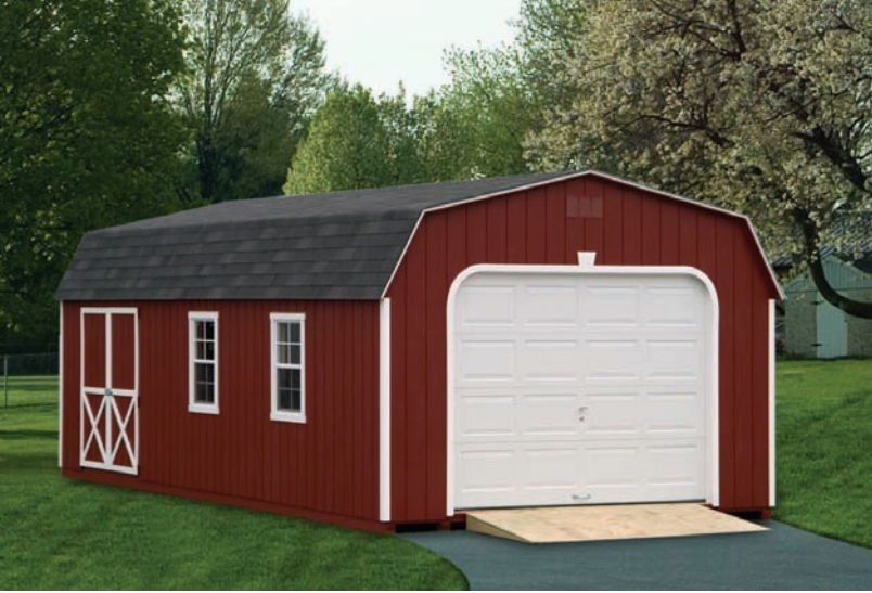
Dalton 12'x24' - Red DuraTemp with White trim; Options Shown: Upsized windows.