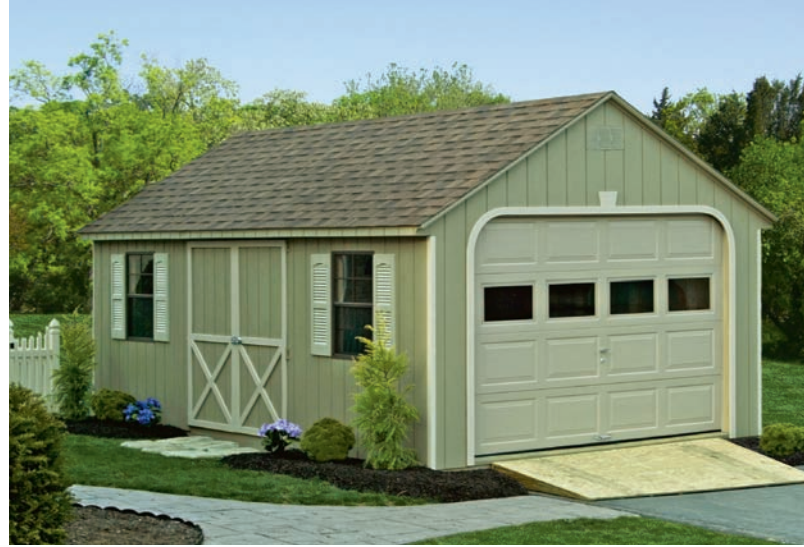
Canton 12'x24' - Clay with Almond trim; Options Shown: upsized windows, upgraded 3' door to double door.